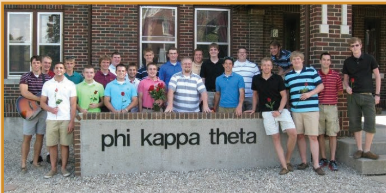
Iowa Xi Chapter serenade a sorority on the front lawn of the Iowa Xi chapter house.

We have 23 live-in members and three new members going through the associate member program. We hope to increase our numbers as the semester progresses. Alumni, we welcome you to visit the campus or chapter house to meet our new members or reminisce with your pledge class.